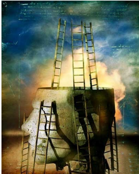
Building a future of permanent support!