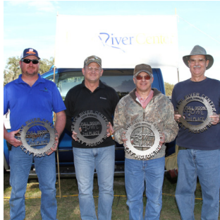
CliftonLarsonAllen - 2nd Place Men's Team