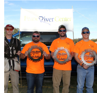
Harris Seafood Restaurant & Oyster Bar - 3rd Place Men's Team