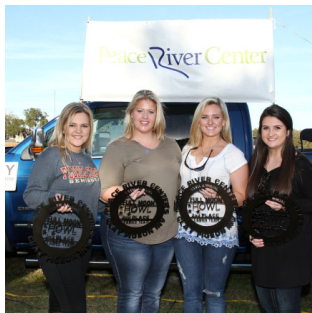
Watkins Associated Industries - 2nd Place Women's Team