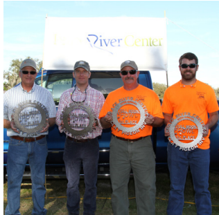
Watkins Associated Industries - 1st Place Men's Team