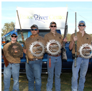
Land South Group Jr. - 1st Place Junior Team