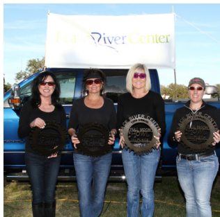
Outlaw Women - 1st Place Women's Team