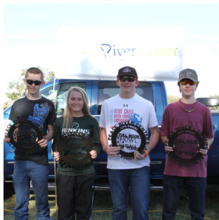
Eagle Eye Jr. - 2nd Place Junior Team