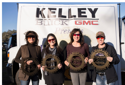
Outlaw Women 1st Place Women's Team