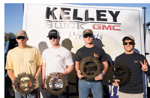
Catfish Team 3rd Place Junior Team