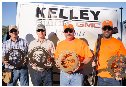
Watkins Associated Industries - Team 1 2nd Place Men's Team