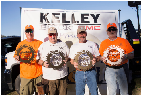
ITB Capital Management - Team 1 1st Place Men's Team