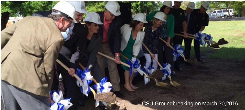
CSU Groundbreaking on March 30, 2016.