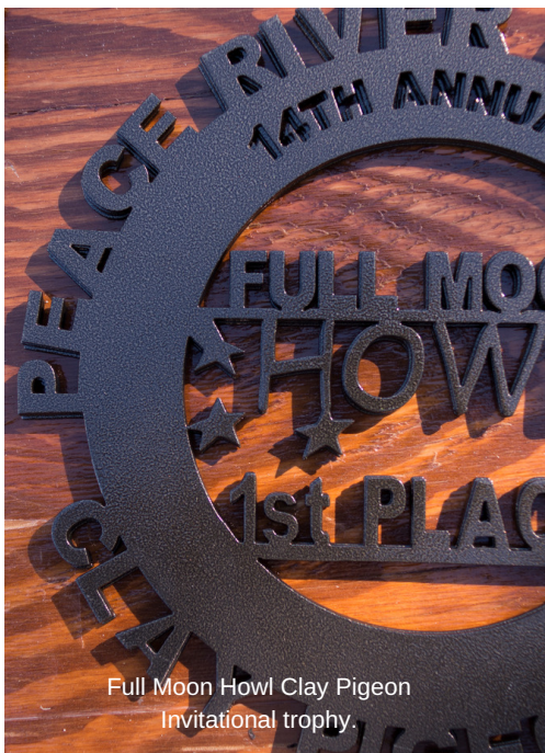
Full Moon Howl Clay Pigeon Invitational trophy.