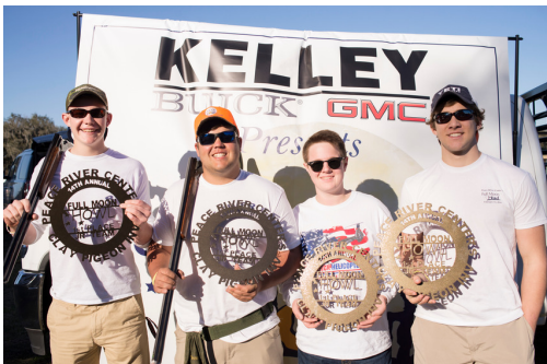
Land South Group 1st Place Junior Team