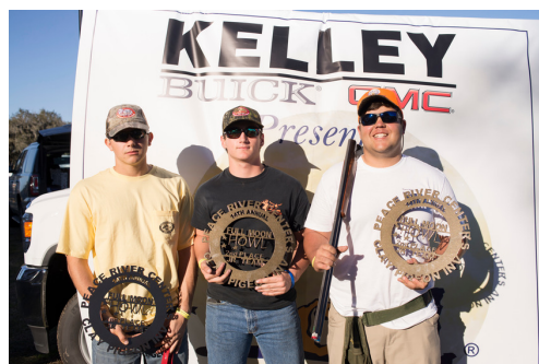
Southern Strategy Group 2nd Place Junior Team