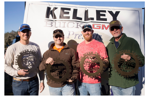
Alltrust Insurance 3rd Place Men's Team