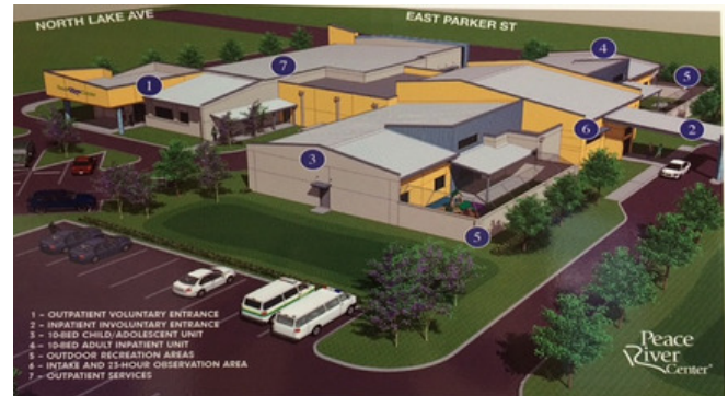
(Design of our new Crisis Campus in Lakeland)

What a year 2016 has been so far! Since our last issue of Streamlines, many Peace River Center activities have taken place and many more have been planned. In this edition you will find our annual Full Moon Howl event highlighted, as it was one of the best years to date. I would like to personally thank everyone who attended and those who gave of their time to make this a phenomenal event. Thank you!